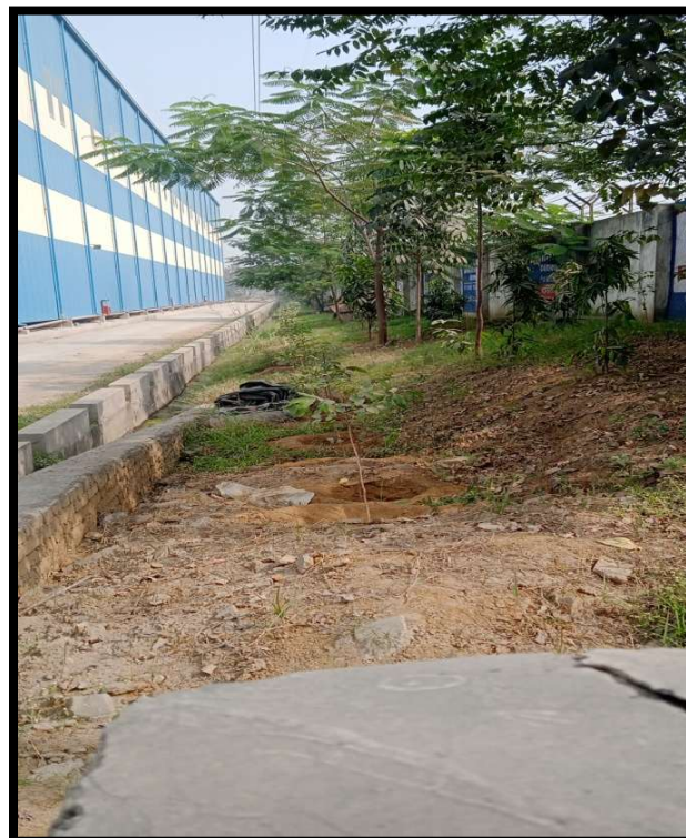
Tree plantation done at plant boundary location